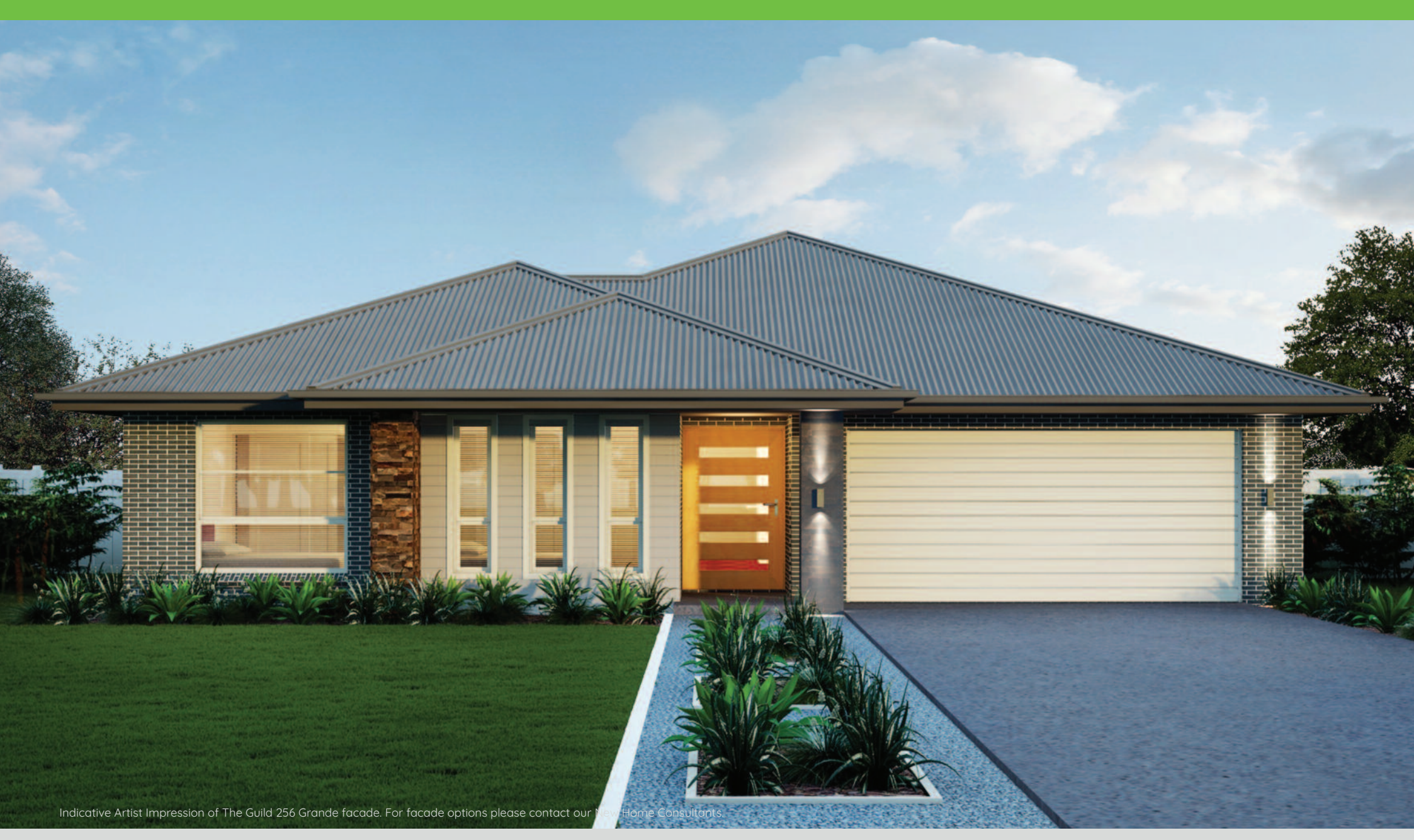
The Guild 256