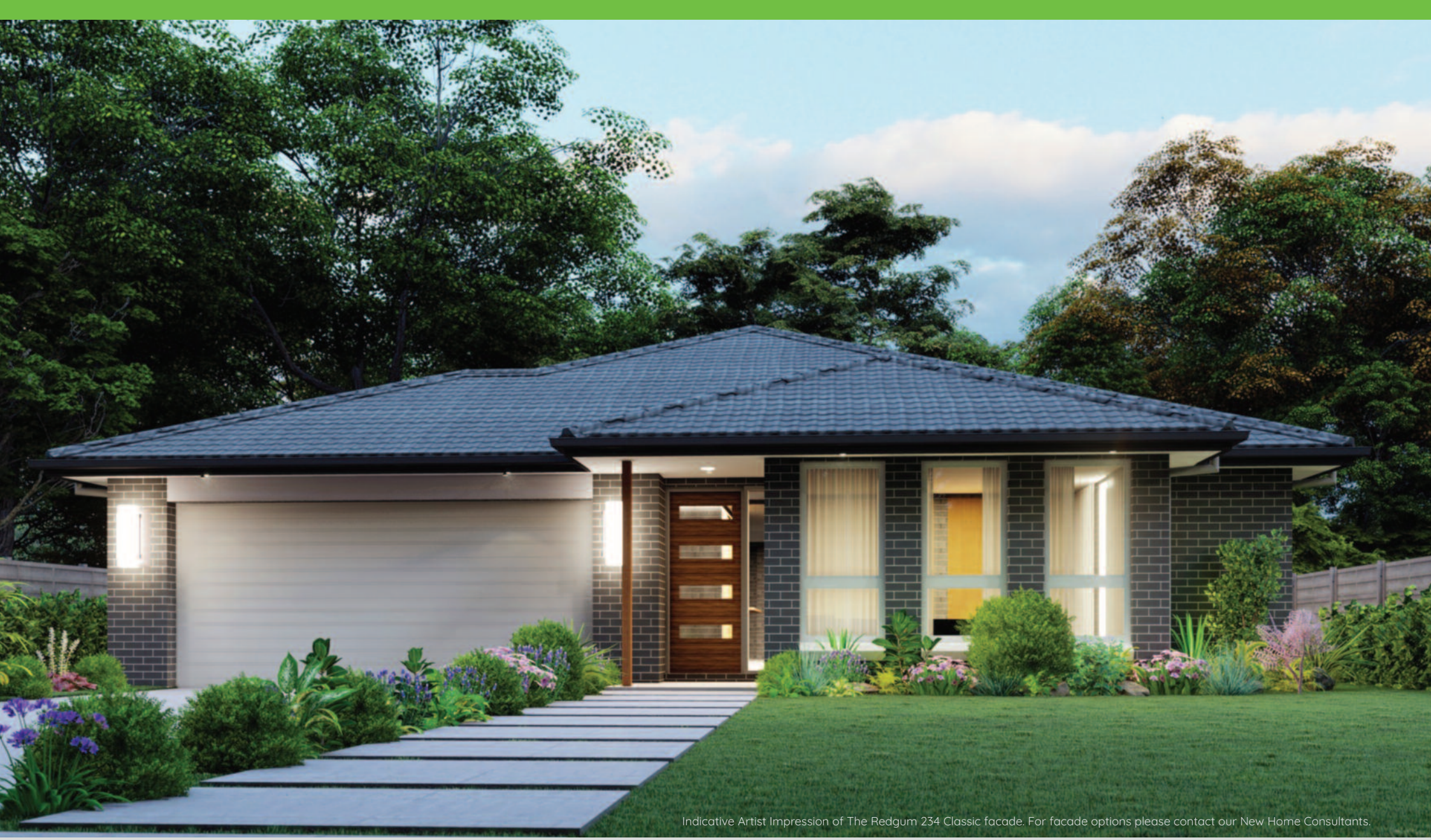
The Redgum 234